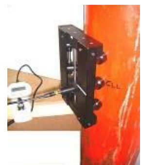
Optional Robo Transducer in use