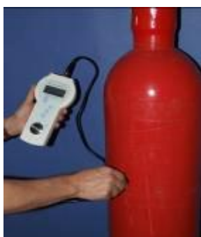
Indicator in use

To use the Robo Transducer simply mark the cylinder with the calculate level, and apply a film of Ultrasonic Gel over the level mark. Fit the Robo Transducer lining it up with the Calculated Liquid Level and its transducer at the bottom which would be 4"/100mm below level. Tune the Comparator to suit the cylinder and then simply slide the Transducer up the rails until the SAW effect signal is clearly indicated. (A full data sheet is available on request).