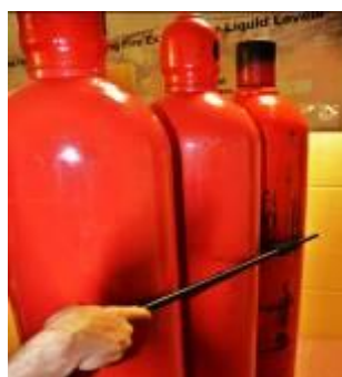
Transducer Extension Rod in use